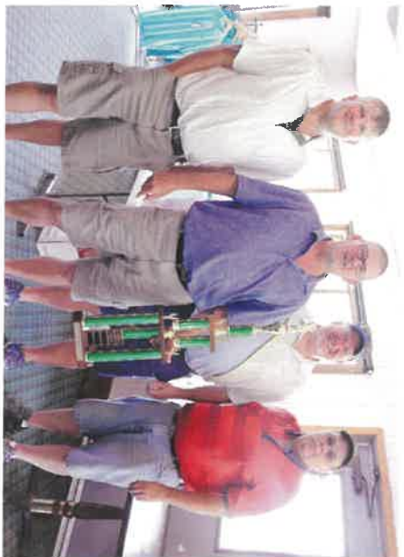
2018 Charity Golf Outing Champions