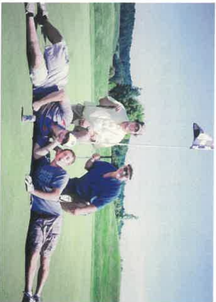
Enjoying the Day