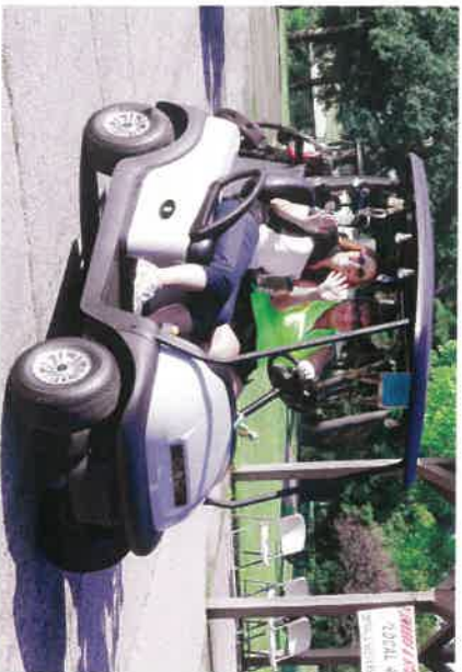
Best decorated cart

Please Follow Us on Facebook UA 434 Charity Golf Outing Page